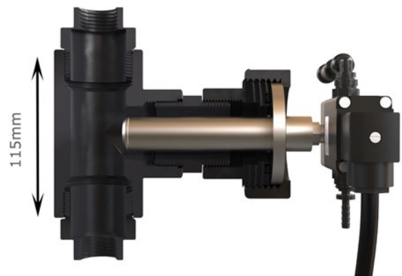
UV254 Sample Strainer Unit - Internal Structure

The strainer unit can be incorporated as part of a new installation, with the self clean cycle being controlled directly from the CRONOS®/CRIUS®4.0 controller. This allows the controller to hold all sensor readings while the clean cycle is performed, avoiding any reading fluctuations being introduced to the sensor data. The cleaning cycle is activated through a single relay contact on the CRONOS®/CRIUS®4.0.