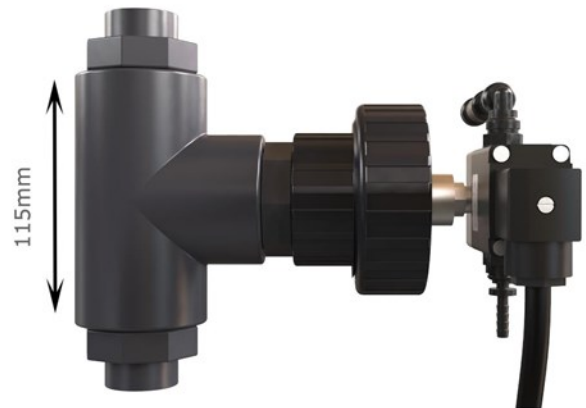
UV254 Sample Strainer Unit

*This strainer unit may be required for samples with high levels of suspended particles to avoid the build up of these particles in the UV254 instrument and negatively affecting the UV254 measurement.